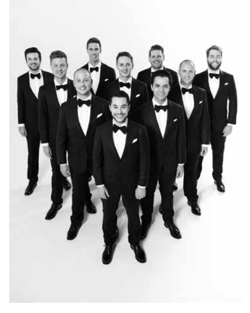
THE TEN TENORS VOCALISTS